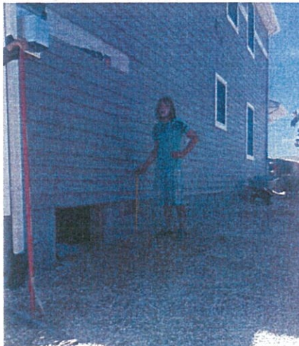
13 Cutlass Way, "Smart Vent", 07/15/13