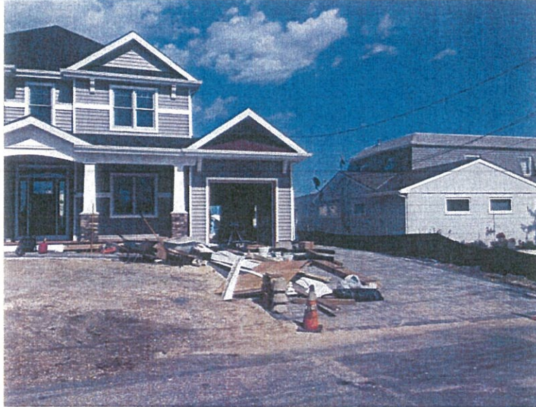
13 Cutlass Way, Front, 07/15/13

If using the Elevation Certificate to obtain NFIP flood insurance, affix at least 2 building photographs below according to the instructions for Item A6. Identify all photographs with date taken; "Front View" and "Rear View"; and, if required, "Right Side View" and "Left Side View." When applicable, photographs must show the foundation with representative examples of the flood openings or vents, as indicated in Section A8. If submitting more photographs than will fit on this page, use the Continuation Page.