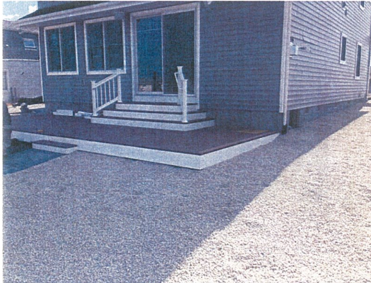
13 Cutlass Way, Rear, 07/15/13